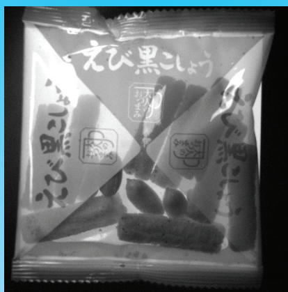
Visible and SWIR